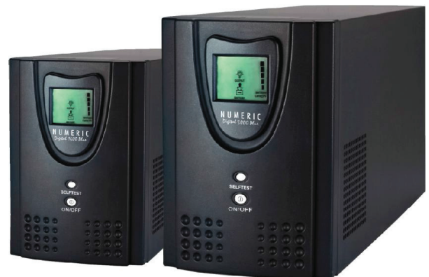
Digital LI SW HR UPS Series 1 kVA - 3 kVA